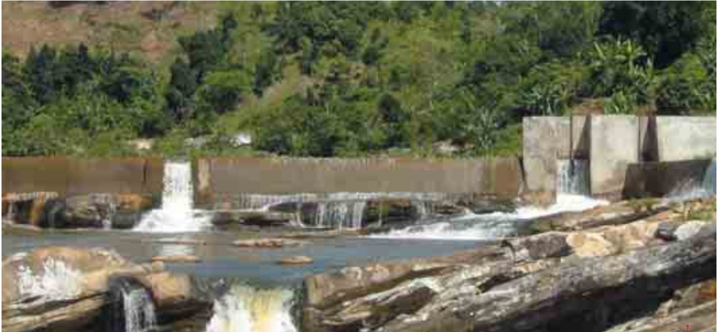
Sahasinaka hydroelectric dam