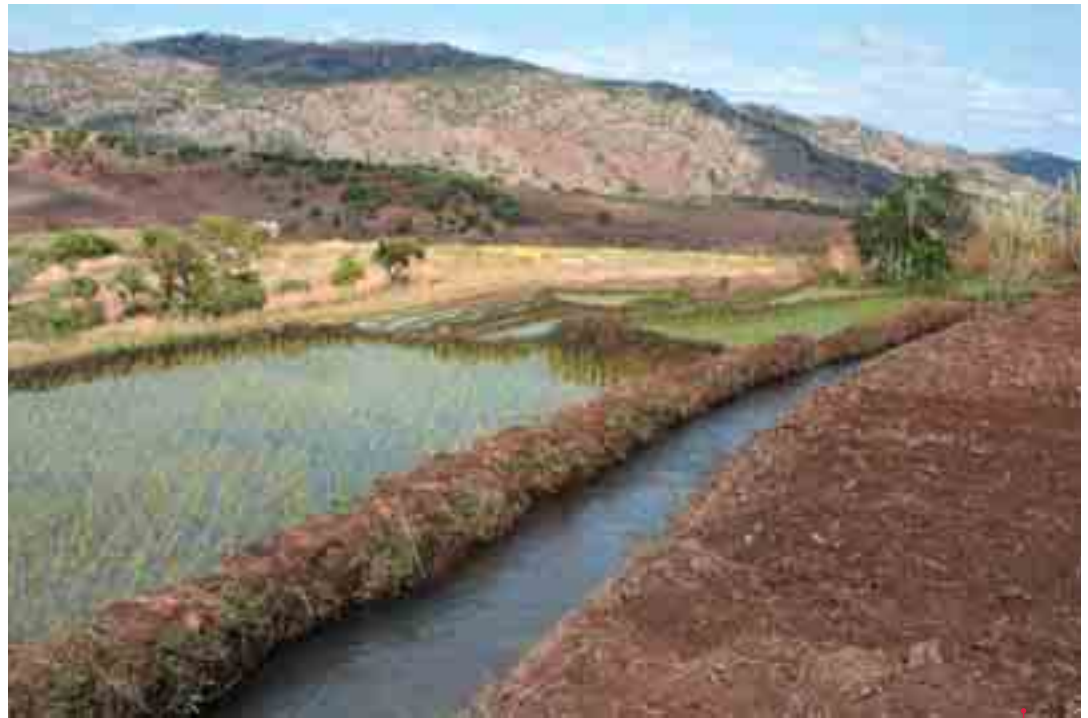
Water sharing and deforestation in the watershed

77% OF THE POPULATION lives in extreme poverty