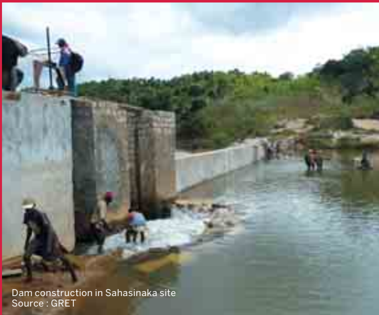
Dam construction in Sahasinaka site

Project Officer - Energy, GRET cerqueira@gret.org